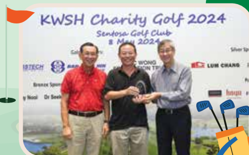
Token of appreciation for the event's top sponsor, Mitsubishi Electric Asia Pte Ltd 向此次赛事的顶级赞助商颁发感谢纪念奖

Special thanks to 特别鸣谢： Mitsubishi Electric Asia Pte Ltd