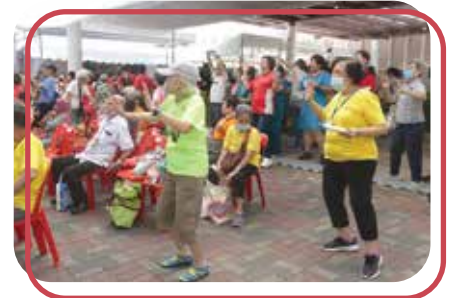
Some seniors spontaneously joined in the workout as our Active Ageing team demonstrated the energetic exercise routines 一些年长参与者即兴随着本院活跃乐龄团队的示范跳起运动操