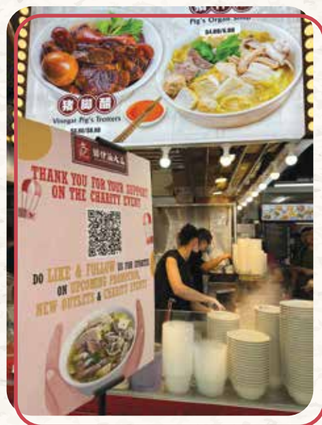
The fundraising drive by Mun Kee Pig Organ Soup raised close to $4,700 for KWSH “文记猪什汤大王”共为本院筹得近4700元

We are delighted with the support from our SME (Small and Medium-sized Enterprise) friends! KWSH was very much on everyone's mind at Mun Kee Pig Organ Soup's stall at the nearby Foch Road coffee shop on 23 May. The outlet, which opened for business in April this year, held a "Pay-As-You-Wish" campaign that day with all proceeds collected on that day donated to Kwong Wai Shiu.