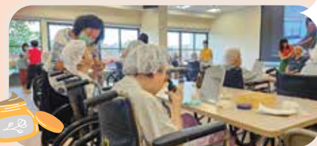
Our volunteer assisting a resident with the DIY facial routine 义工协助一名院友进行自我护肤