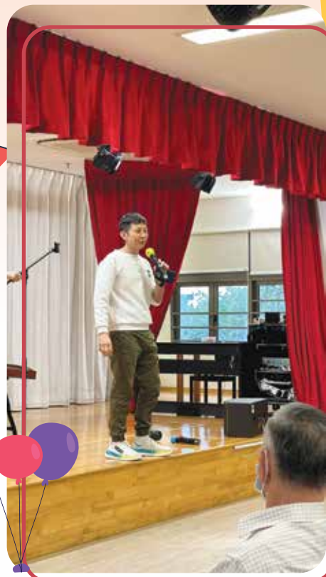
Singing for his audience! 为本院的这些服务对象高歌一曲！