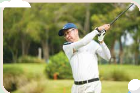
The guest of honour was Mr Lim Boon Heng, Chairman of Temasek Holdings 淡马锡控股董事长林文兴担任活动主宾

The KWSH Charity Golf 2024 event was held on 8 May at the prestigious Sentosa Golf Club. This annual fundraiser returned to the scenic island venue for the second consecutive year, providing a beautiful backdrop for participants and sponsors alike. Mr Lim Boon Heng, Chairman of Temasek Holdings, was among the 140 golfers and he also presented tokens of appreciation to the event sponsors at the post-golf dinner.