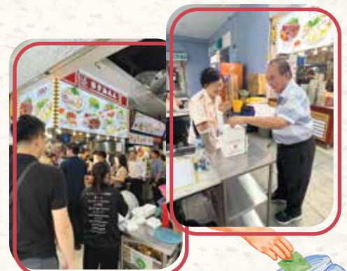
After placing their orders, patrons of the stall could "pay" for their meals by donating any amount to KWSH 食客点餐后，可随意向广惠肇乐捐，以为食物买单

看到我们所处社区中的这家中小企业伸出援手，分享他们的爱，这让我们感到特别欣慰。我们将继续期待着来自四面八方的其他朋友们的鼎力支持。