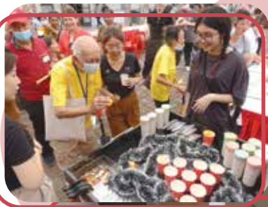
Health screening and games for the community elderly 为社区年长者提供身体检查和有趣游戏