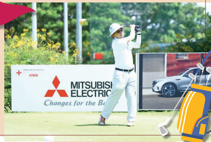
Former DPM Wong Kan Seng gamely took part in the golf tournament for a good cause 黄根成前副总理应邀参加，为慈善挥杆

演唱会和高尔夫球赛分别筹集85万2402元及47万5000元善款，广惠肇留医院感谢所有捐赠者和赞助人在前景如此不明朗的情况下仍旧慷慨解囊。且让我们一起迈开步伐，共同迎接更美好的明天！