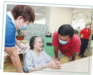
Minister Ong interacting with a resident at the ward during his tour of the premises 王部长参观分院，到病房问候院友