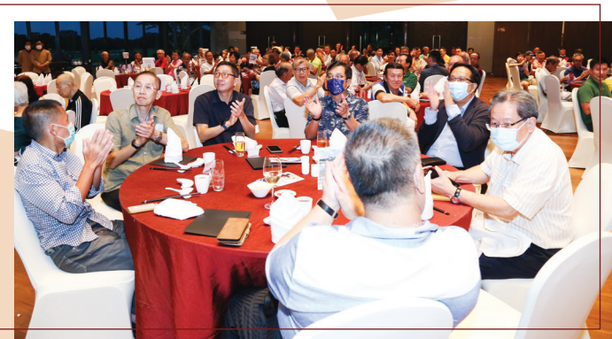
Post-golf dinner held for the first time since the pandemic 赛后晚宴自疫情爆发以来首次得以举行