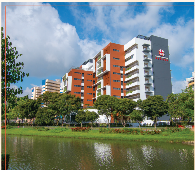
Waterfront view of KWSH@PTP: A nursing home by the bay “滨海疗养院”：拥有河畔景观的波东巴西分院

首先是本院的失智症病房！我们的长期合作伙伴陈笃生医院派了一个受过失智症培训的护士团队到波东巴西分院，协助提高本院护理人员的失智症护理技能。通过病房初期运营阶段的在职培训，我们的护理人员可更妥善地接收和管理失智症患者。同时，陈笃生医院也可以将他们的床位等资源用来照顾更多的急性患者。这个合作关系也促进了急性护理和社区护理之间的跨机构交流及学习！