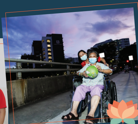
The mesmerising twilight sky kicked off the Mid-Autumn celebration at KWASH@PTP 迷人的晚霞开启了波东巴西分院的中秋晚会