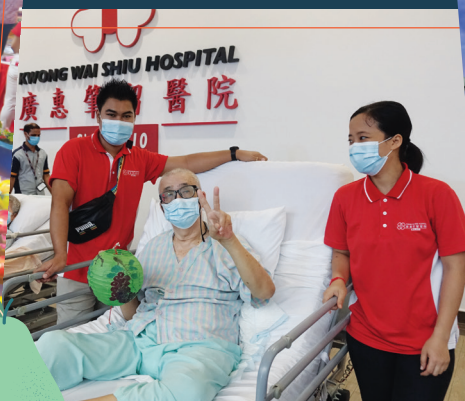
Even bedbound residents had the opportunity to come out of their wards to celebrate the lantern festival 必须终日躺卧在床的院友也难得走出病房，一同提灯、赏灯