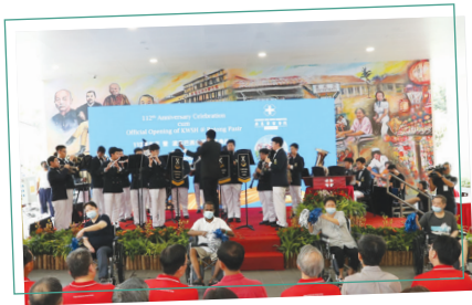
Secondary school students from the neighbouring St. Andrew's School jointly put up a performance with four KWSH@PTP residents 毗邻的圣安德烈学校的中学生和四名分院院友联手呈献表演