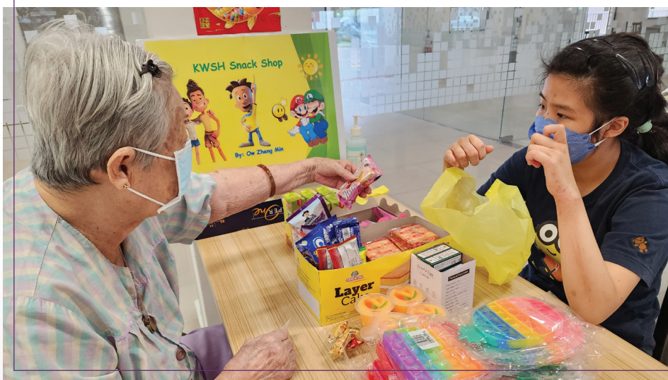
Our NLS student-shopkeeper attending to a resident at the "KWSH Mama Shop" 北烁学生在“广惠肇妈妈档”为院友效劳

Beyond guiding students in exploring the line of community care, we also provide opportunities for them to contribute to the sector in their current capacity. For example, to spark nostalgia among our residents, the Hospital had set up a "mama shop" on our Serangoon Road premises in February this year, allowing our seniors to relive their past experiences of stepping out to pick up necessities. Our staff contribute items like