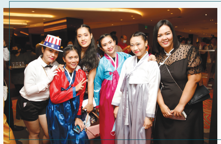
Our care staff traded their uniforms for a touch of multi-cultural flair 护理同事纷纷卸下制服，大变身呈现各国风情