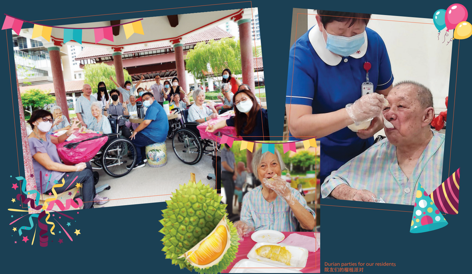
Durian parties for our residents 院友们的榴梿派对