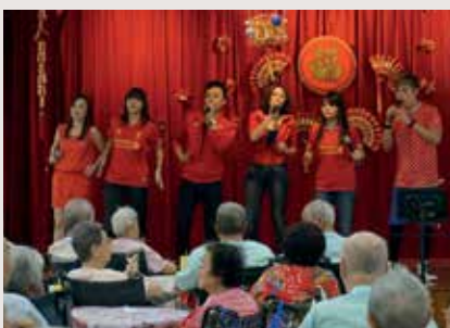
Entertainment by famous Getai singers 由著名歌台歌手呈现歌舞节目