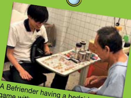
A Befriender having a bedside chess game with a resident