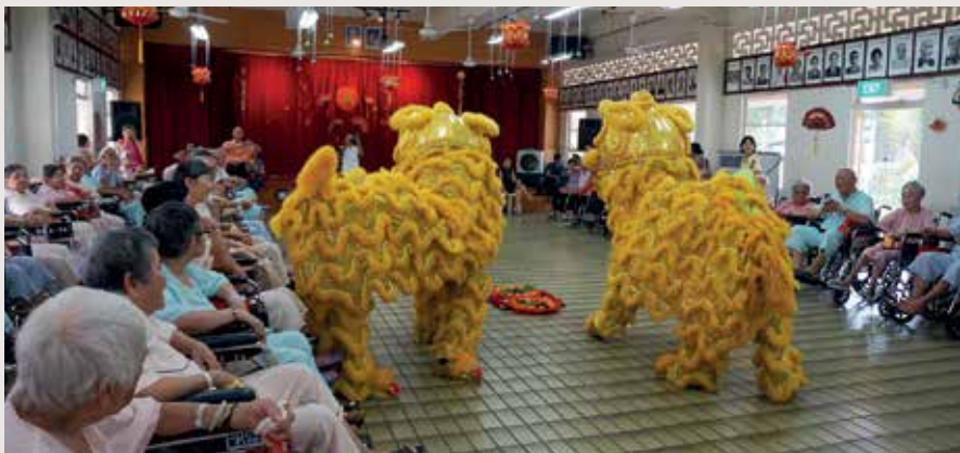
Traditional Lion Dance performance sponsored by Microsoft 由微软赞助的舞狮表演者

非常感谢微软和德明政府中学的学生舞狮团为医院院友呈现愉快和难忘的新春节。他们虽然不能在家里与家人庆祝新年，但也能因此体验了华人佳节的气氛。