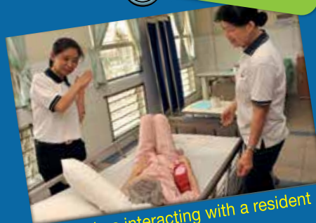
Befrienders interacting with a resident in the ward