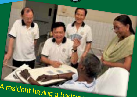
A resident having a bedside card game