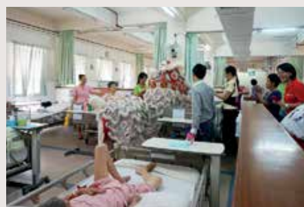
Dunman High School Lion Dance Troupe greeted the residents from bed to bed in the ward. 德明政府中学的学生舞狮团与病房院友近距离互动